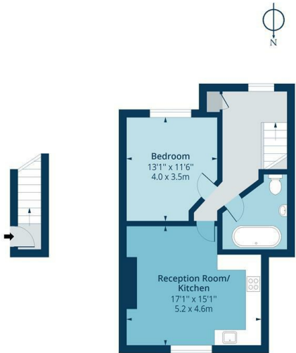
First Floor Floor Area 33 Sq Ft - 3.07 Sq M